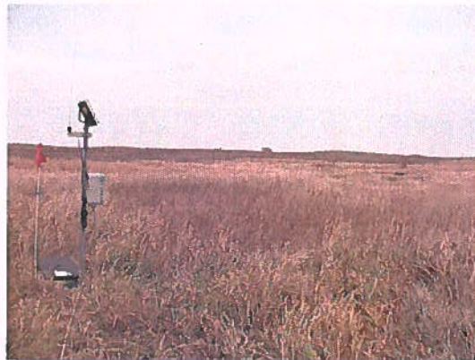
A view of an installed bioreactor, showing the upper control structure and warm season grasses that have re-established in soil covering the bed of wood chips in which water is treated.

The Denitrifying Bioreactor is available Nationwide and can be used by farmers for financial assistance as soon as their State NRCS has incorporated the new standard into its handbook. Farmers should check with their local NRCS office for the latest information.