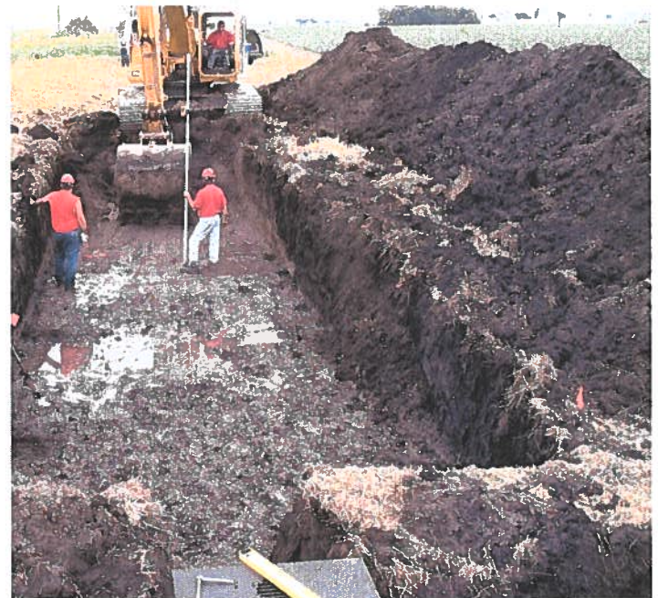
Excavating the pit for bioreactor installation.

on size, location, and a variety of other factors, but the average bioreactor can be expected to remove up to half of the nitrates in water flowing through it.